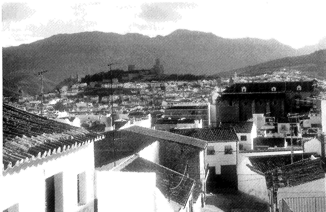
Figure 4. A residential area of traditional housing

of houses in Antequera had a mains water supply and electric power. In many, cooking and heating infrastructure was rudimentary (Sistema Estadístico de Andalucía, 2001). It is perhaps not too surprising, therefore, that many households prefer a modern apartment or house with modern facilities (de Miguel, 1998). Manifestly, this presents a major problem for the conservation of the most typical and fundamental features of the urban landscape. As modern, internationally influenced houses and flats replace smaller, vernacular style cottages, the cumulative impact on the townscape is considerable.