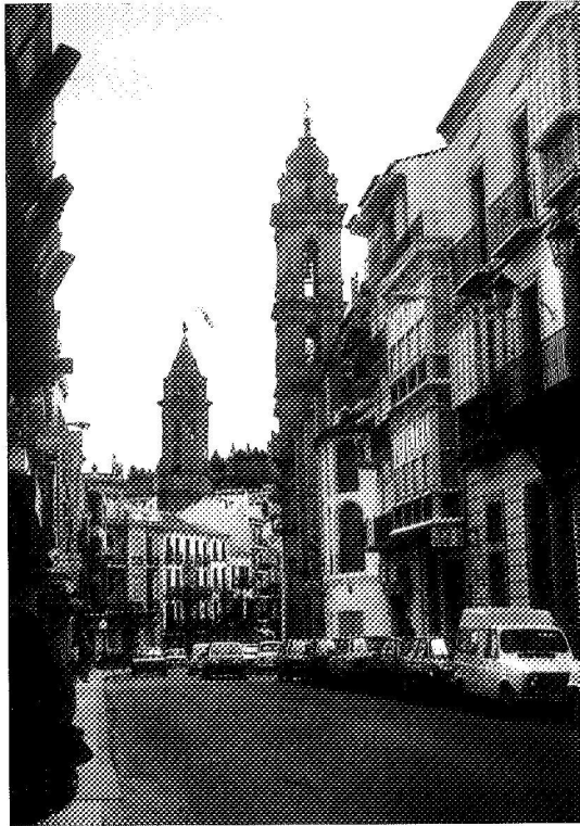
Figure 2. Calle Infante (area A1), looking towards the castle.