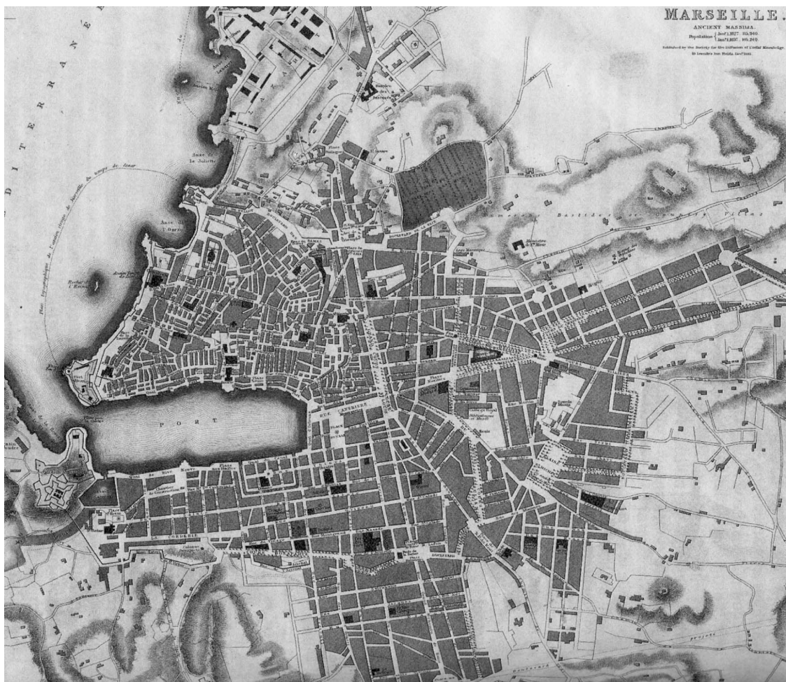
Figure 1. Marseille in 1840: reproduced from Roncayolo, op.cit. (note 21) 372.

is a matter of passive acceptance. In contrast, in the south and south-east the new town created by the enlargement of 1666 extends southwards along the prestigious Prado axis. It is the smart neighbourhood par excellence ; the residential area of the bourgeoisie, including its shops, banks and places of entertainment.