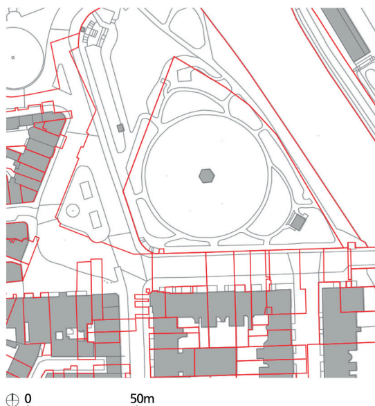
Figure 4. An overlay of land ownership on built form in part of Bath, England, showing a right of way or servitude . Base mapping © Crown Copyright and Database Right (2017). Ordnance Survey (Digimap Licence). Land Registry Index Polygon data licensed under the Open Government Licence v3.0.

the land. Known colloquially as an easement, right of way or wayleave, a servitus (or in current Civil Law a servitude ) gives an individual or group a right of access over land without any other property rights. The concept explicitly separates ownership (with the right to buy and sell the land) from the use of the land in the form of a right of access. Figure 4 shows the freehold title boundaries of the land in red. They are crossed over by the streets or ‘public highway’ (carriageway and footway), represented by grey lines. The public highway and footway are public rights of way ( servitudes ) and are controlled by the local authority. Technically, the local authority control extends only down to the depth of the physical structure of the carriageway and footway.