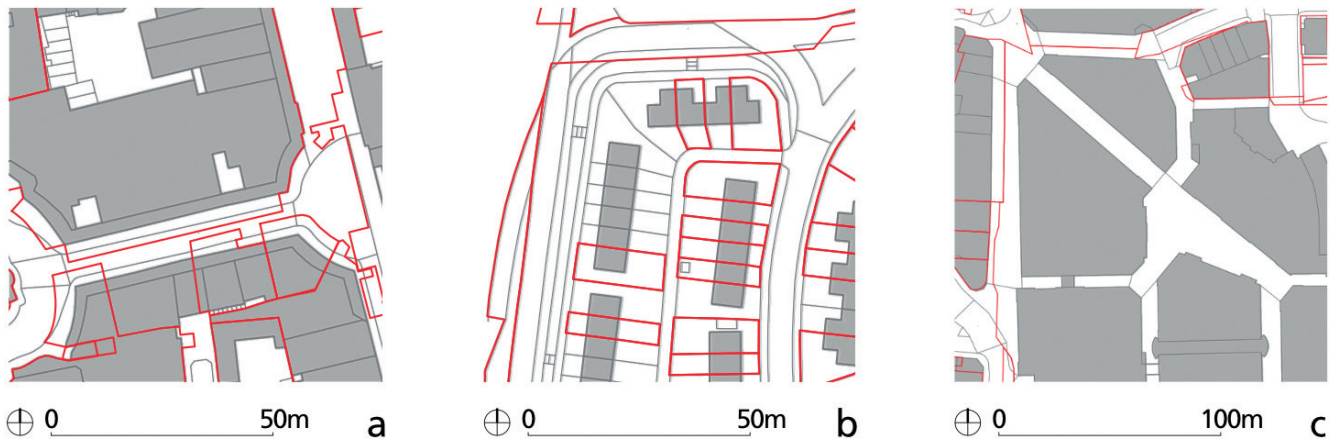
Figure 3. Overlay of land ownership (in red) on built form, in part of Bath, England. (a) Multiple plots/buildings largely within one ownership (upper half), and different parts of a single building in separate ownerships (lower half). (b) Buildings, plots and street spaces in multiple private ownership. (c) Mixed public and private ownership reflecting ‘right-to-buy’ legislation.

from the lease while the leaseholder only has the right of use. Both freeholds and long-term leaseholds are recorded in the English equivalent of a cadastre, called the Land Registry. Looking only at the pattern of freehold as shown in the Land Registry Index Polygons (Figure 3), the pattern is much coarser than the pattern of physical boundaries. Some of the boundaries of the freehold properties have no obvious physical manifestation and may cut across physical boundaries. In contrast, the pattern of leaseholds generally corresponds to plots, buildings and apartments. In some instances the property boundaries are not recorded in the Land Registry but only in historical paper deeds.