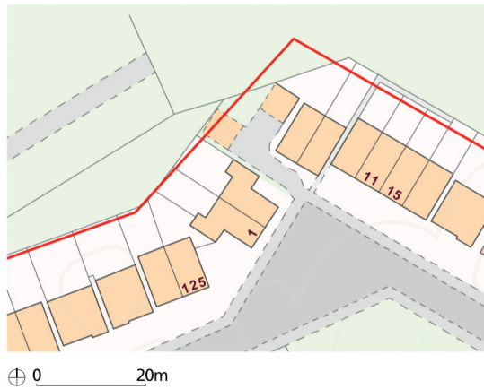
Figure 5. An ownership boundary (in red) and a physical boundary (in black). Base mapping © Crown Copyright and Database Right (2017). Ordnance Survey (Digimap Licence). Land Registry Index Polygon data licensed under the Open Government Licence v3.0.

to the north-east) and the ceding of other land (mainly to the north). Ultimately, as suggested above with reference to legal and social sanctions, adherence to a boundary comes down to defensive behaviour of one kind or another. The behavioural foundation of property and its boundaries is attested to in a recent UK government study that highlights the frequency of legal boundary disputes (UK Ministry of Justice, 2015). The intangibility of property boundaries makes space for legal wrangling.