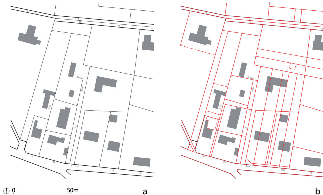
Figure 2. Part of Aumont-en-Hallate, France. (a) Physical features of plot boundaries and buildings as determined from aerial photography. (b) Overlay in red of property boundaries from the cadastral plan.

physical boundary. Within the French system (and others), a given parcel might be subdivided either for the purpose of assigning title to different people or for levying taxes at different rates. In such cases the subdivisions of the property do not necessarily correspond to specific physical features. Some of the divisions are arbitrary with respect to physical form and there are more subdivisions of property than there are of form.