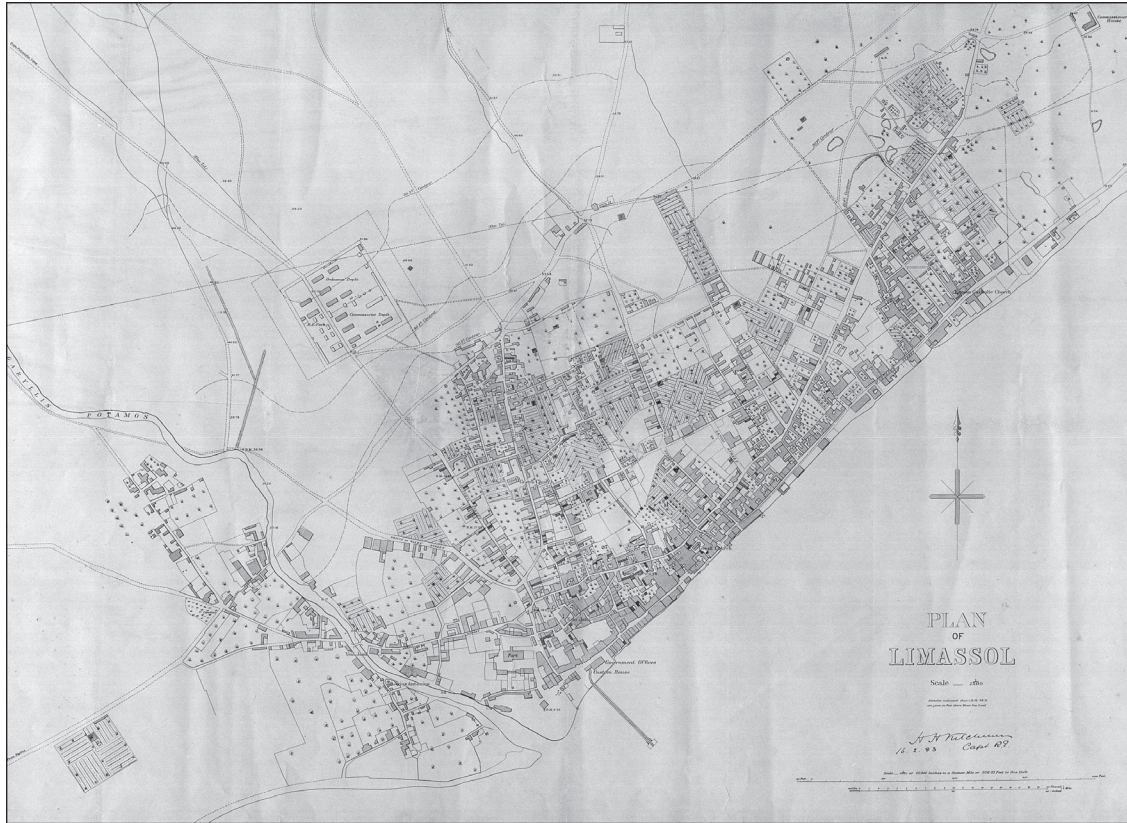
Figure 2. Map of Limassol by H. H. Kitchener (1883) (Rodney, 2001).

been made available since June 2016 through an online portal. A series covering cities in the late 1990s and 2000s at the scale of 1:5000, digital scanned cadastral maps from the Department of Land and Surveys and a digital version of parcel maps dating from 2010 have also been produced for the northern part of Cyprus.