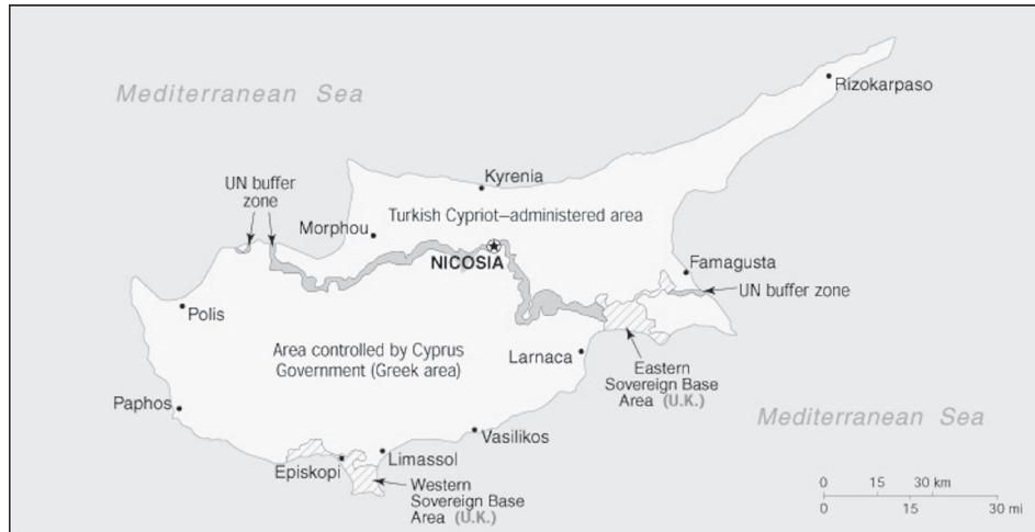
Figure 1. Cyprus.

years. Urban design and planning education takes place within such departments, but there are few educational programmes and modules dedicated specifically to these disciplines and to the study of urban form. Analysis of urban form and education in urban issues is gradually becoming more prominent in understanding urban life and informing planning research in Cyprus. Urban municipal authorities, policy makers, urban designers and scholars are now pressed to respond to issues of urban management, such as migration flows, traffic congestion, land use distribution, increasing spatial inequalities and various design questions, including accessibility and walkability.