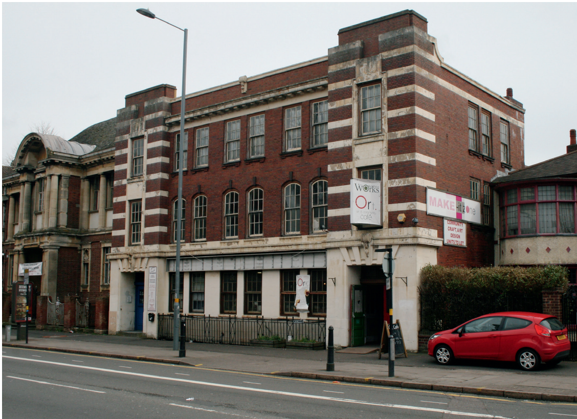
Figure 6. Old Print Works and Ort Café – new cultural facilities housed in a converted factory facing Moseley Road. Photograph by the authors, 2016.

Jill used this story to make a point about how some wealthier, white outsiders imagine Balsall Heath as having a threatening atmosphere and thus erect invisible walls around it. She contrasted this negative image with the neighbourhood's vibrant arts and creative scene. Balsall Heath was home to the Moseley School of Art (1900–1976) and the base for the Birmingham Surrealists in the 1940s and 1950s (Poolman and Rowe, 2014). More recently the Old Print Works (OPW) and Ort Café have been established in a disused factory building on the Moseley Road (Figure 6), providing a hub for a variety of arts practitioners based in and around the neighbourhood. From the outside, the