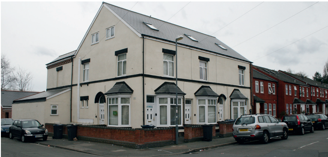
Figure 5. Former Old Crown pub, unrecognizable from its previous use, now converted to housing.

stood derelict for several years before being converted into housing in 2012 (Figure 5). Other uses to which former Balsall Heath pubs