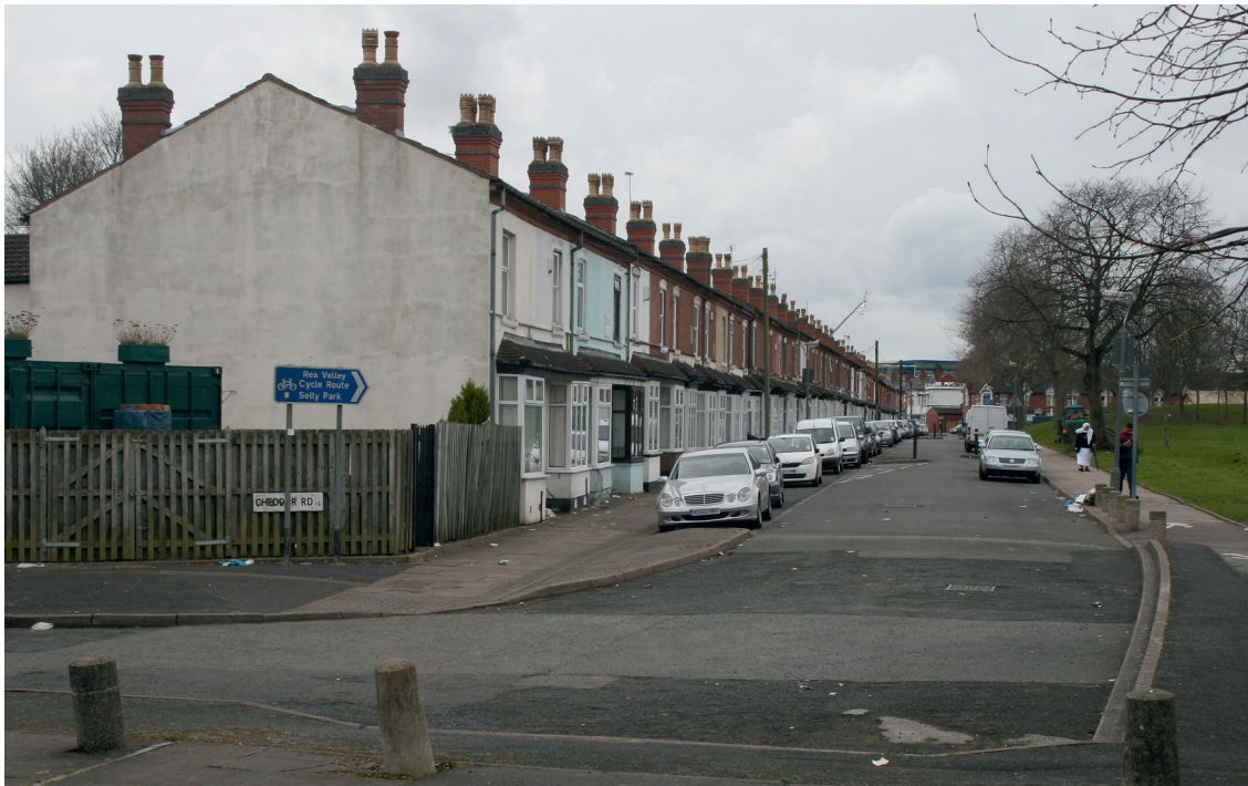
Figure 2. Cheddar Road, showing measures to prevent through traffic as part of changes to the physical landscape intended to deter drive-by soliciting of sex workers. Today it is an unremarkable street of nineteenth-century terraced housing.

driven in large part by the Muslim community, which has grown rapidly over the last 30 years to become the largest ethnic group in Balsall Heath. One of the most visible manifestations of this demographic shift is in the retail and leisure sector within the neighbourhood. One of our older African-Caribbean participants, with whom we walked around the neighbourhood on several occasions during the film-making process in the summer of 2015, spoke fondly of the shops present in the north-western part of Balsall Heath when he was a child prior to slum clearance. There was considerable nostalgia in this account, but also a reflection on the changing contemporary retail landscape. Shops in the area no longer cater for the rapidly shrinking African-Caribbean community, making it hard to source West Indian speciality foodstuffs. This participant spoke candidly about the experience of being black in Balsall Heath today, particularly his perception of facing racial discrimination at the hands of Muslim shopkeepers, contrasting