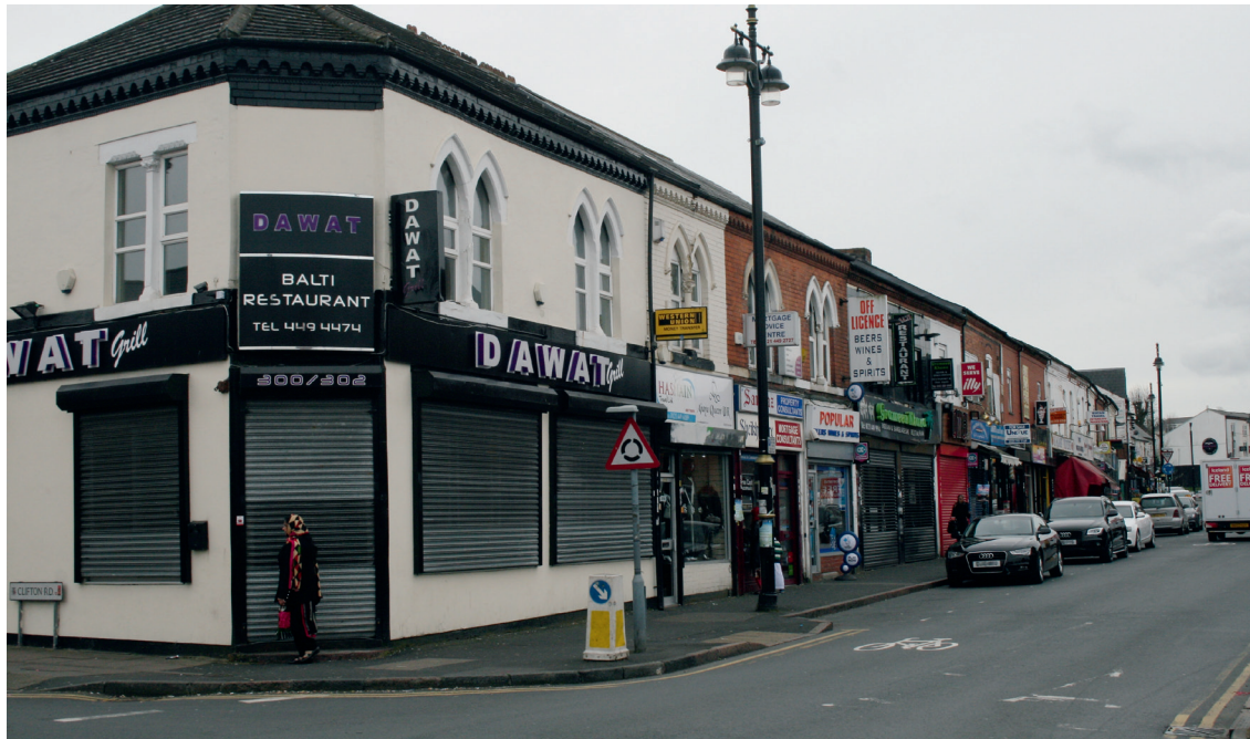
Figure 3. South Asian restaurants in nineteenth-century buildings on Ladypool Road.

there's lots of different businesses here, there is J.P. Jewellers which has been here for over 30 years, there is Zamzam kebab house on the corner of Ladypool Road, and then we've got all jewellery here, we've got ladies clothing, we've got Jewel Box which sell all artificial jewellery, then we've got Dixy's takeaway chicken, then we've got Rehman Jewellers which has been here for about at least 20 years. (Smartphone app audio recording, 2012)