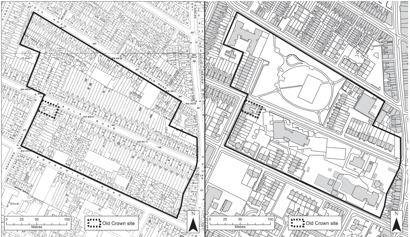
Figure 4. Detail of St Paul's Road area before slum clearance (left) and after redevelopment (right). The former Old Crown is the only building that survived the redevelopment.

Pickwick Park. The former pub, the only remaining original building on the site, is now unrecognizable from its former use, having